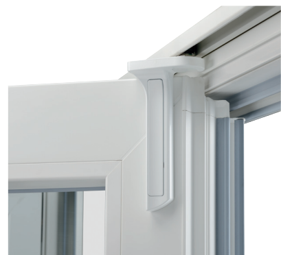
Strong support-bracket: Enables tall and heavy sashes

Roto Patio Fold not only meets high demands made in terms of technology and convenience, it is also characterised by sophisticated design: slim, elegant, and available in many colours. This enables the premium Fold&Slide system to open up new dimensions in design. Roto Patio Fold – the Fold&Slide system that meets the highest of demands.