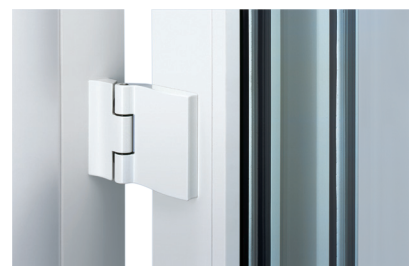
Frame hinge: Adjustable and powder-coated